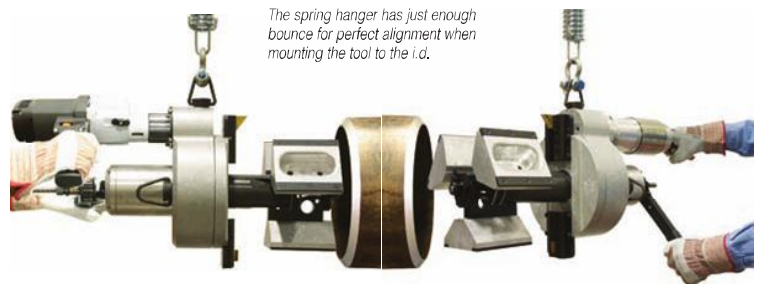
Electric or pneumatic both drive motors deliver plenty of power for the toughest pipe alloys.