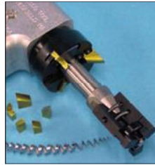
"Tube Weasel" features the rigid EscoLock blade lock system and titanium nitride coated cutter blades which combine to pull a thick continuous chip on all types of tube and pipe without cutting oils.