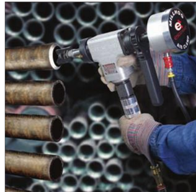
The "Air Clamp" Tube Weasel MILLHOG® is ideal for production applications and takes only minutes to convert from a manual clamping end prep tool to one of the fastest clamping tools on the market.