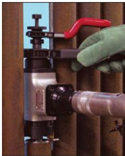
The "Tube Weasel" fits a Dutchman window for single tube end prep work and totally sealed construction allows it to be used in any orientation. Most importantly, the holding clamps are designed to stay on the mandrel and not fall down the tubes.