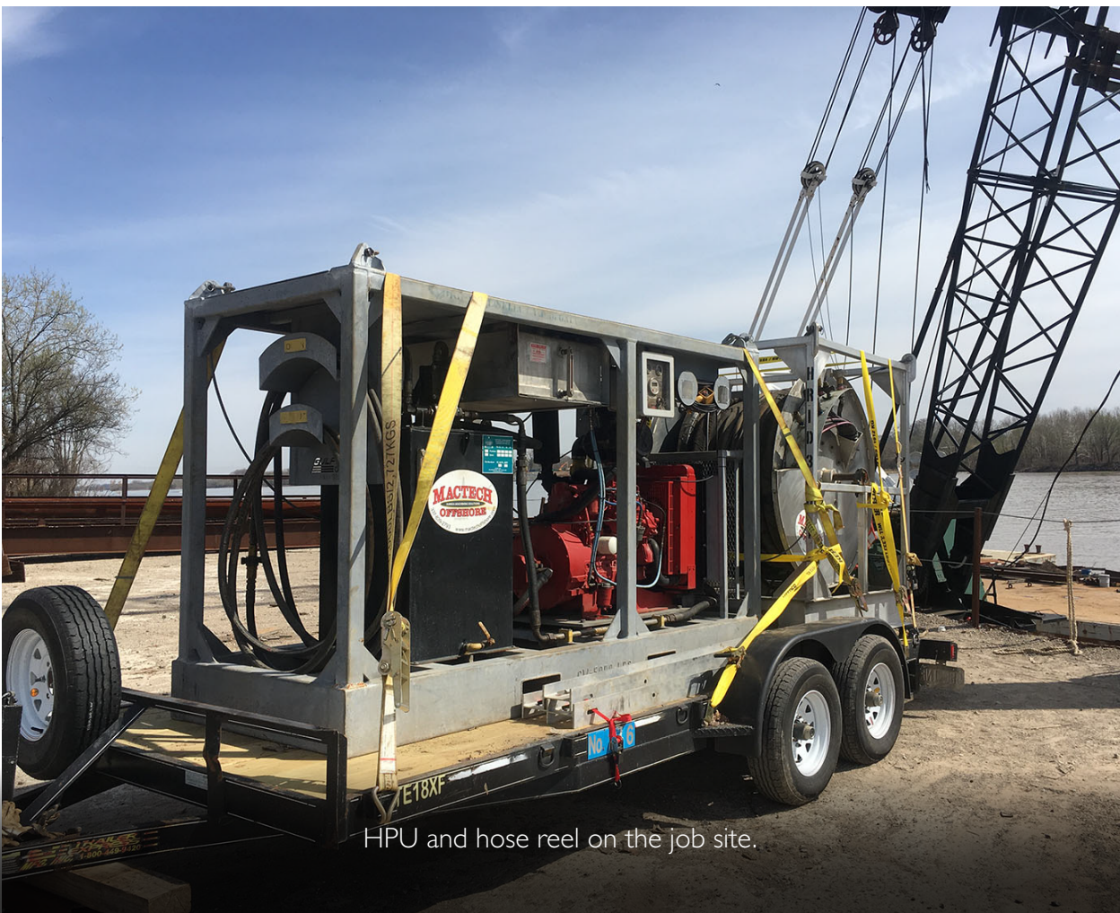
HPU and hose reel on the job site.

The project was completed approximately 1 week ahead of schedule with no damage to the platform or equipment. Mactech had no reported injuries.